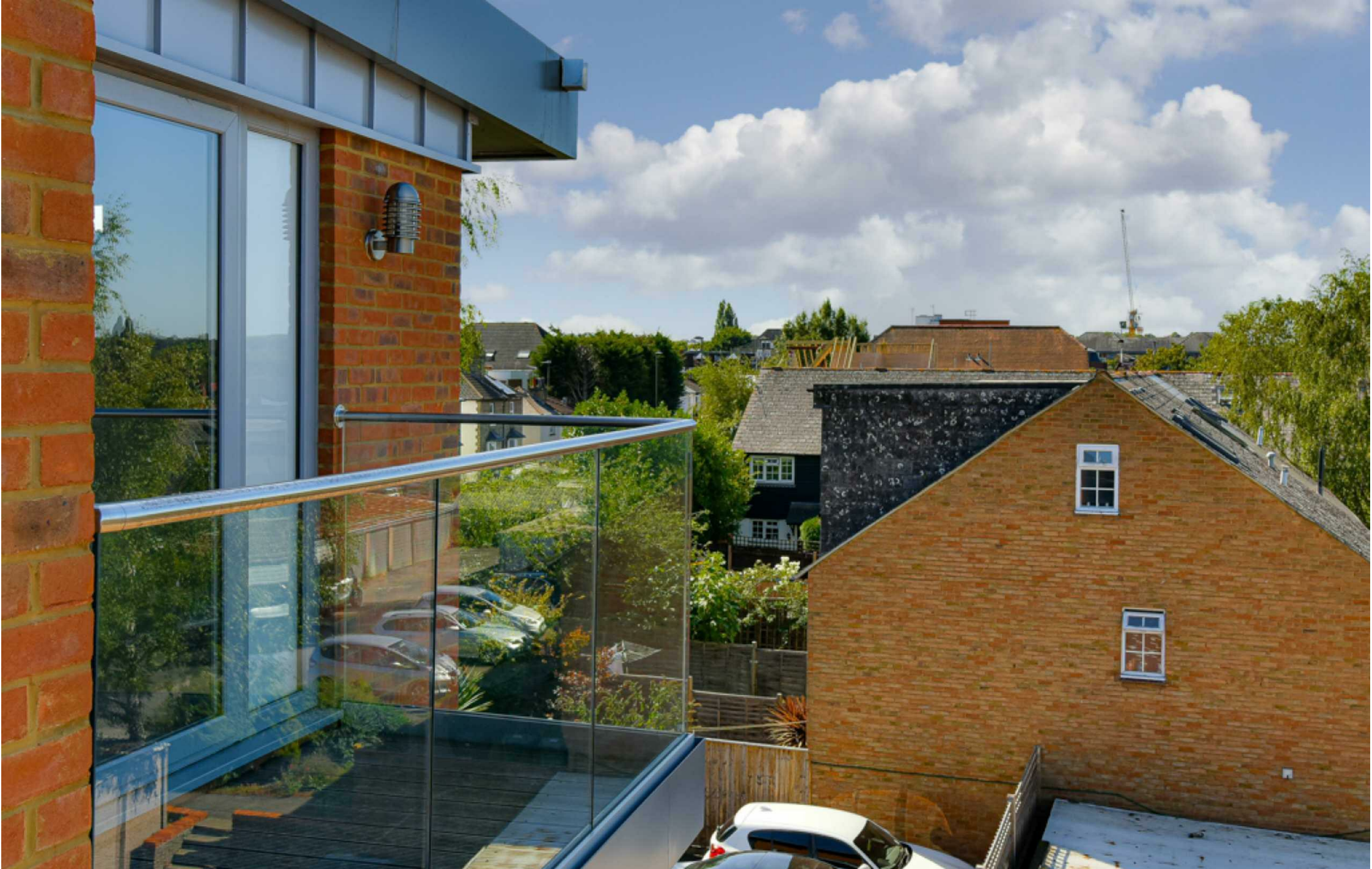
Acer House, East Street, Epsom